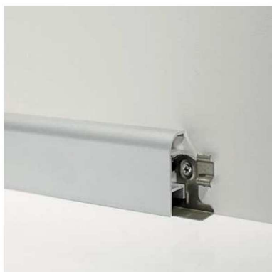
97/4SF silver anodised aluminium + 8602/C fixing clip