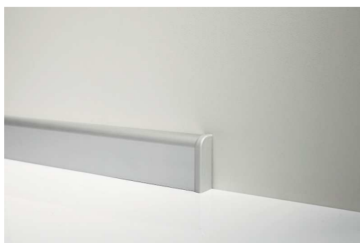
right end cap